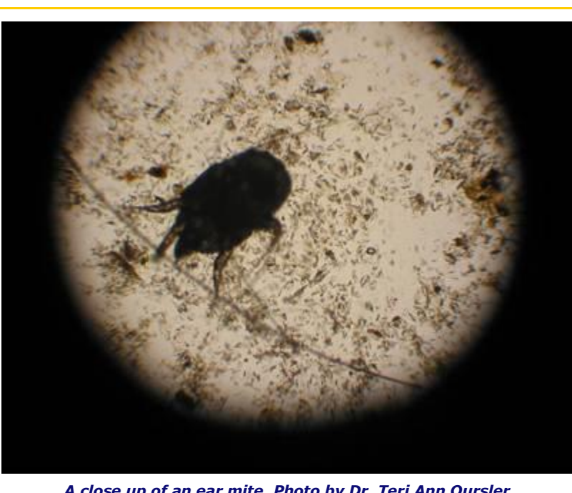
A close up of an ear mite. Photo by Dr. Teri Ann Oursler

Ear mites are tiny infectious organisms resembling microscopic ticks. The mite can just barely be